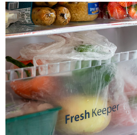
THE CONTESTED FRIDGE SPACE IN QUESTION.