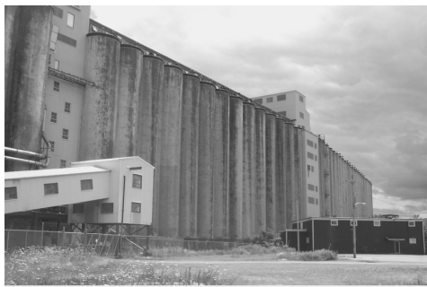
Dalhousie School of Architecture to Feature Breathtaking Halifax Grain Elevator on Recruitment Brochure